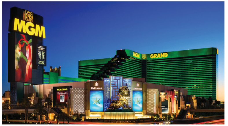
Topgolf - Largest Topgolf facility in the world located at the MGM Grand

Shadow Creek - One of the nation's most exclusive and top-rated golf courses. The course is available exclusively to guests of MGM Resorts International properties in Las Vegas